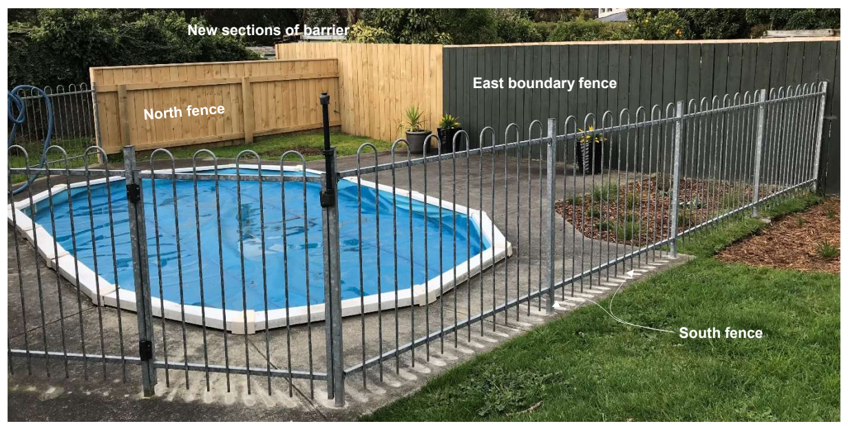
Figure 1: Photograph of the pool area and barrier