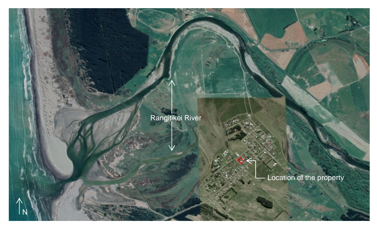
Figure 1: Aerial photograph of site (not to scale)

2.7 The scope of the second building consent application included raising the proposed addition and the existing building 1.5m on timber piles, to be above the known flood level. The scope of this building consent also included the proposal to construct the addition and the internal alterations.