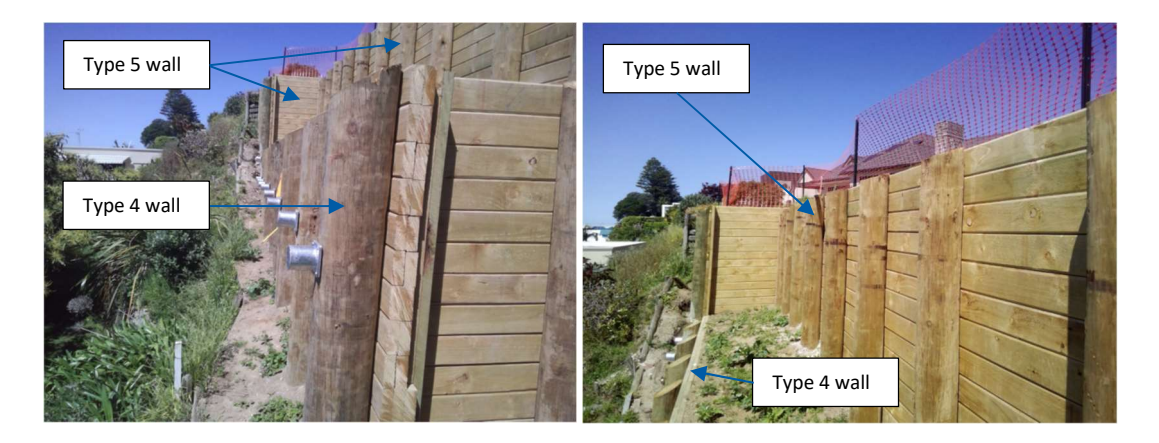
Figure 3: Lower view of walls Figure 4: Mid-level view of walls

(Note: both figures 3 and 4 are views of the walls looking in an easterly direction)