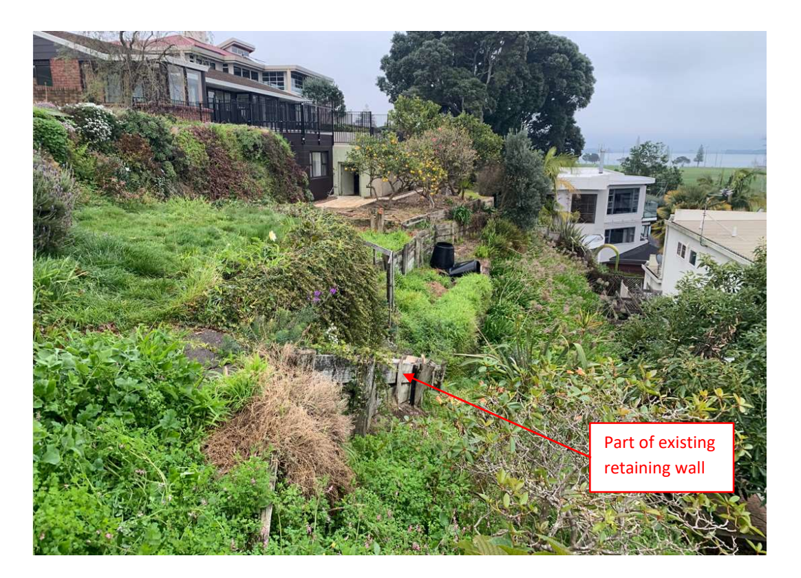
Figure 9: Westerly view prior to commencement of the building work