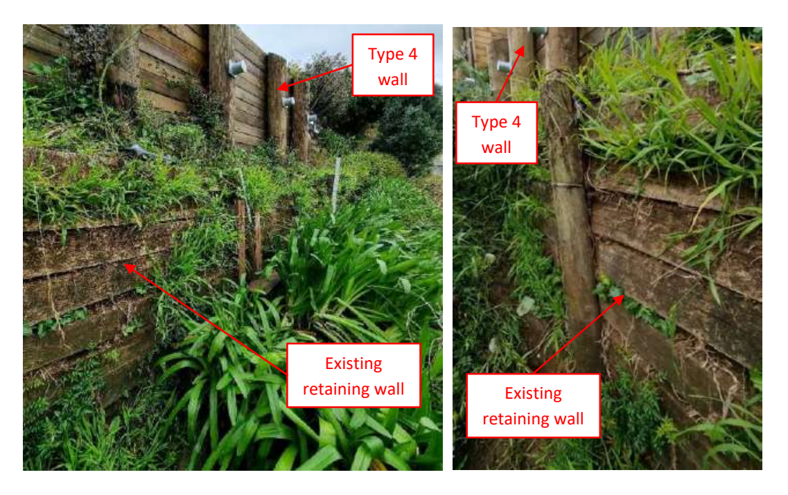
Figure 7: Westerly view