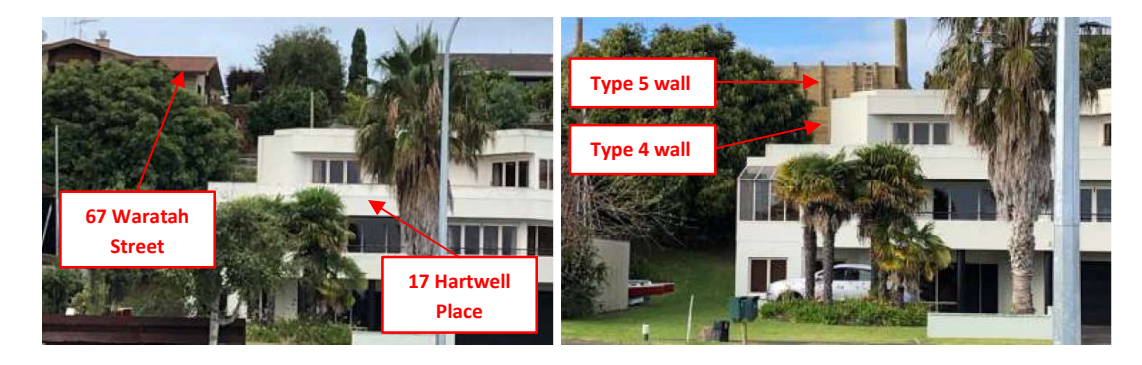
Figure 5: "Before"

The letter from the legal advisor also included photographs prior to, and after, the construction of the retaining walls (figures 5 and 6).